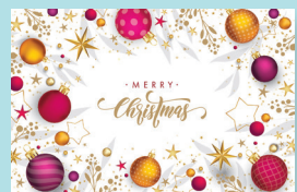
Beautiful Baubles Code: BA488 Gold foil