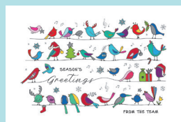
Tweet from the Team Code: FE423 Silver foil